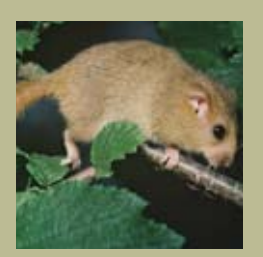
The People's Trust for Endangered Species